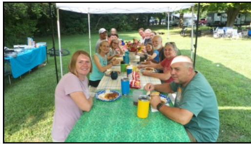
Potluck meal on Saturday night