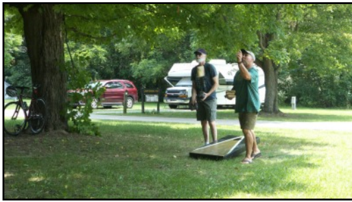
Corn hole competition