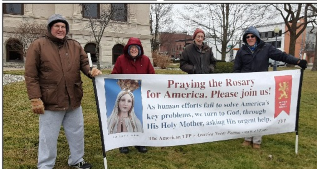
Prayer Rally Patrons from February 10, 2024